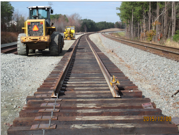
U-4716 Nelson to Clegg Passing Siding, track construction