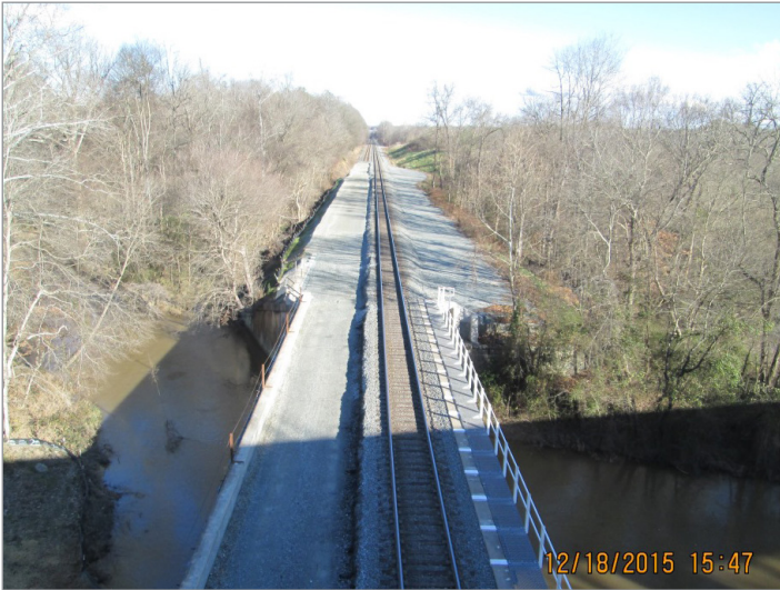
C-4901 Bowers to Lake, Rich Fork Creek Bridge