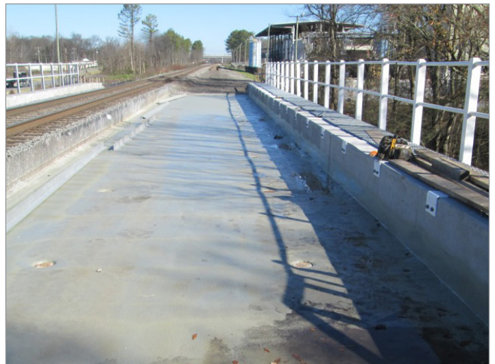
P-5208 Haydock to Junker, Rocky River Bridge Construction