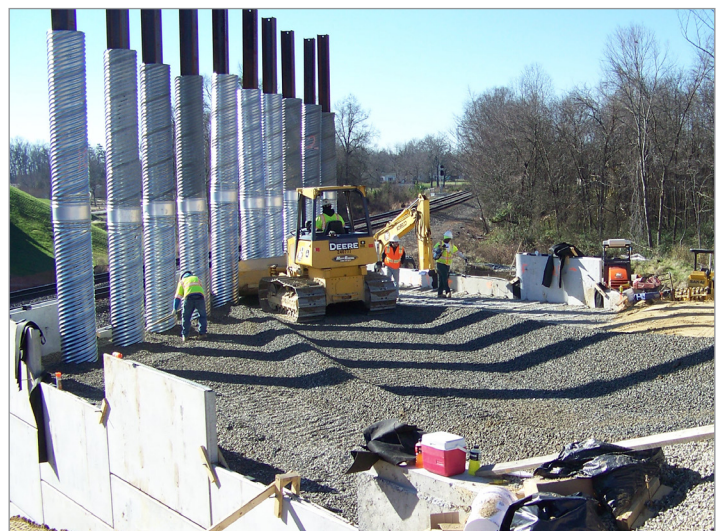
P-5204 McLeansville Road Bridge Construction