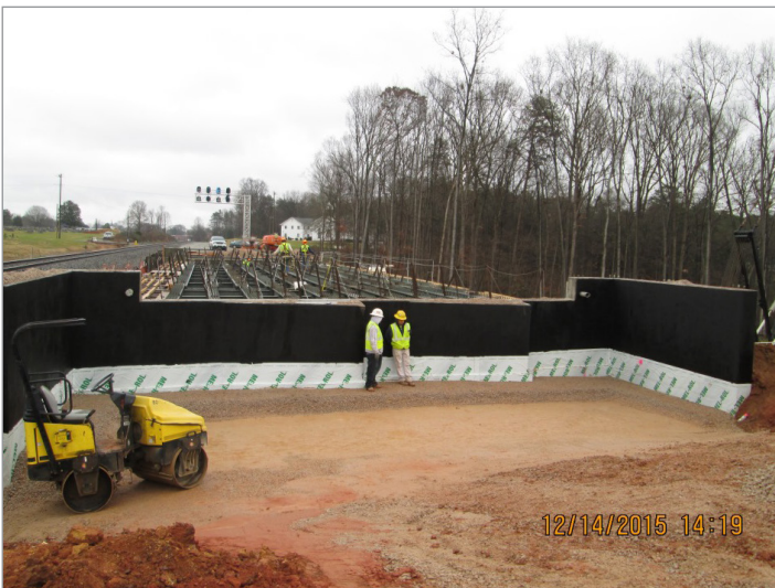
P-5206 Reid to North Kannapolis, Kimball Road Bridge waterproofing and backfill