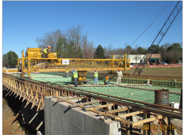
P-5201 Morrisville Parkway, bridge construction