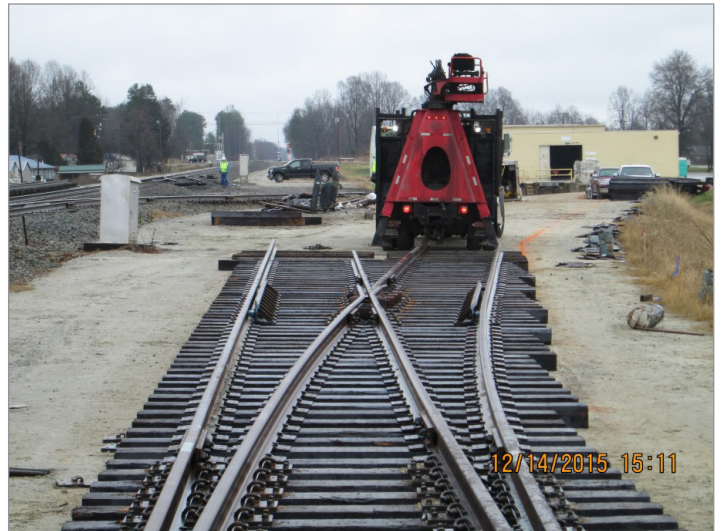
P-5206 Reid to North Kannapolis, industrial track construction