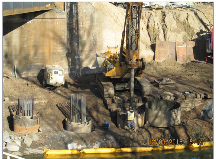
P-5208A Haydock to Junker, Coddle Creek Bridge, drilled shaft construction for north interior bent