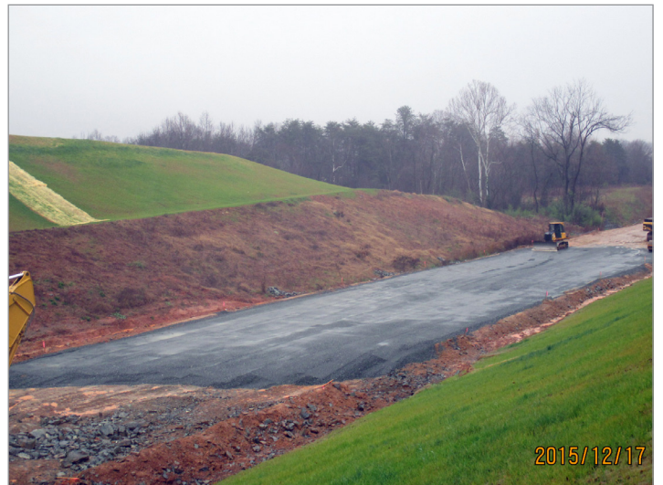
P-5205 Graham to Haw River Passing Siding, new alignment