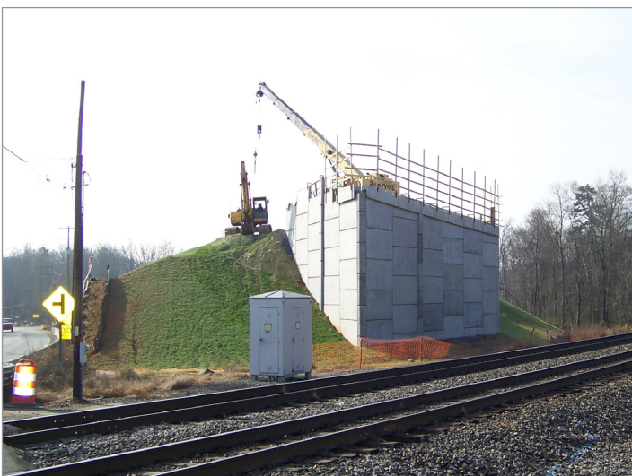
P-5204 McLeansville Road Bridge Construction