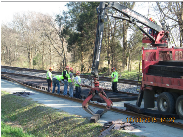
P-5208 Haydock to Junker, Track Construction