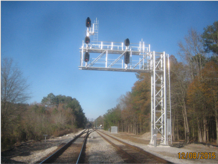
Congestion Mitigation Project, CP Armstrong signals in service